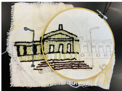
Imelda's punch needle artwork