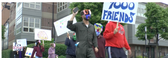
Ray Graham Training Center, "Carnival and Change-making 2022"

CAPE reaches 4,000 students annually with programs designed to engage students in their learning and inspire teachers and community members. This year, CAPE's 90 teaching artists will collaborate with classroom teachers, arts educators, and other school staff at 44 schools.