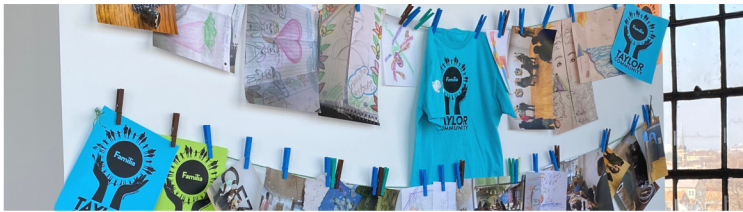
"Comadres en el Arte" Multi-School Community Class Project

CAPE Parent/Community Classes provide contextualized creative and continuous development opportunities for parents and families of CAPE students. The classes integrate the arts with community-articulated needs such as English language learning, technology skills, career development, civic and ecological issues. Community classes are co-taught by teaching artists and teachers and illuminate for parents the connections between art making and learning, and how parents can observe evidence of learning and development in their child's arts and academic work.